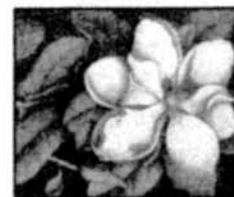
SGHS Registration 7 Garden Lane New Orleans, LA 70124