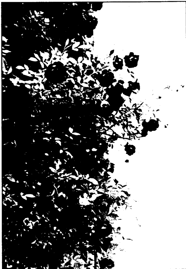
This climbing China rose is one of the few truly red heirloom varieties.

We hope those few cuttings of our red China succeed so that, in time, the climbing 'Cramoisi Superieur' will again become available to rose enthusiasts. Meanwhile, I would appreciate any additional information on this beautiful rose that may help to document its past +