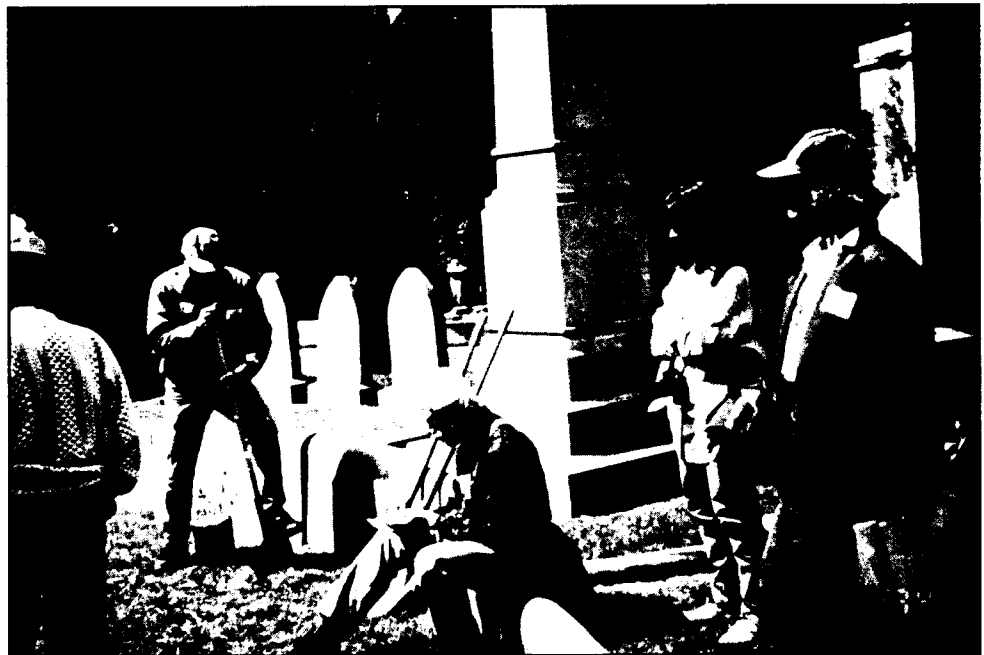
Members of the Heritage Rose Foundation plant old roses in the burial plot of President James Monroe in the Hollywood Cemetery, Richmond, VA, during the annual meeting of the Foundation in May.