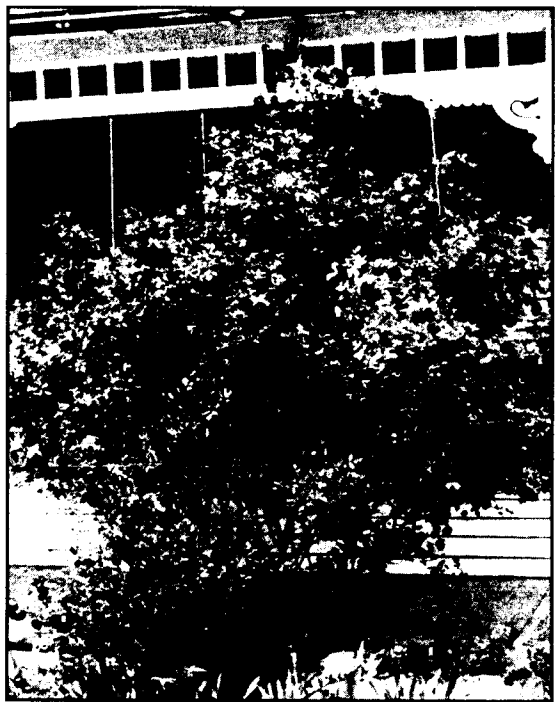
The magnificent 'Cramoisi Superieur'.