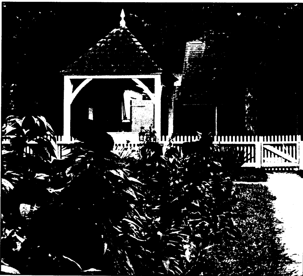
Giant Crested Cockscomb (Celosia cristata) in Deane Garden.