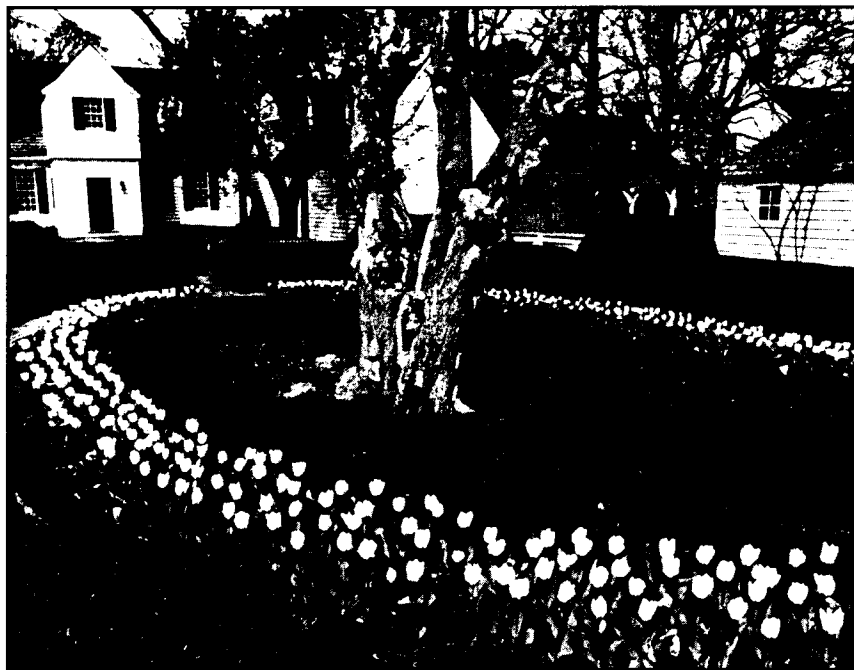
The Orlando Jones garden in Colonial Williamsburg.

Certainly, the theme chosen for the Twelfth Annual Meeting of the Southern Garden History Society belongs to the members of the Colonial Williamsburg Foundation who are intimately involved with its restoration. For the better part of this century,