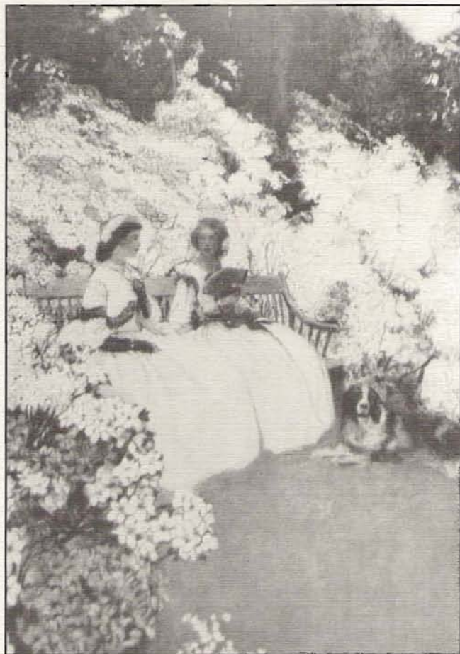
"A Visit on the Lawn in Olden Time"—from " Magnolia Gardens ."