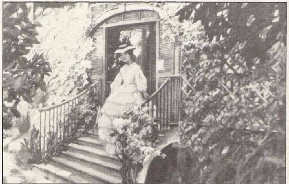
"Climbing – Roses Over the Porch of the (Simonton) Alston House" – from "Charleston Gardens."

About Middleton Place – certainly I hope to do the article, but I am by no means sure I can manage it speedily. It