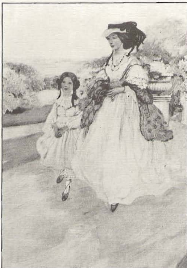
"When Middleton Place Was in Its Prime" – from "An Old-Time Carolina Garden."