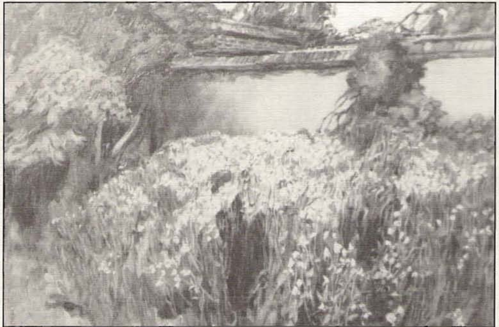
"A Garden Wall," from "Charleston Gardens."

Frances Duncan was much impressed by Charleston's garden walls, usually brick laid in English bond. In an attempt to imitate the English landscape, the nineteenth century had done away with fences and walls in many areas and Americans were beginning to realize their loss. Gates were another construction detail remarked on by Duncan and drawn by Betts. Of wood, wrought iron or a combination, they were a signature of Charleston gardens. The young writer also commented on the design unity between house, garden and outbuildings – servants' quarters, kitchens, and stables. "There are no 'back premises' to dodge furtively...." Plants were often used to tie structures and spaces together – yellow