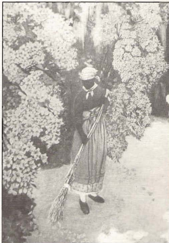
"Azaleas in the Magnolia Gardens" – from "Magnolia Gardens."