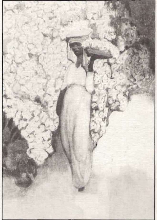
"The Path by the Long Pond" – from "An Old-Time Carolina Garden."