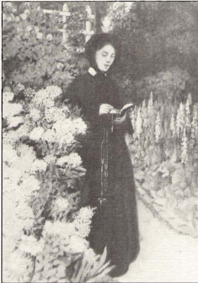
"Garden of the Nathaniel Russell House, Now Owned by the Sisters of Mercy" – from "Charleston Gardens."