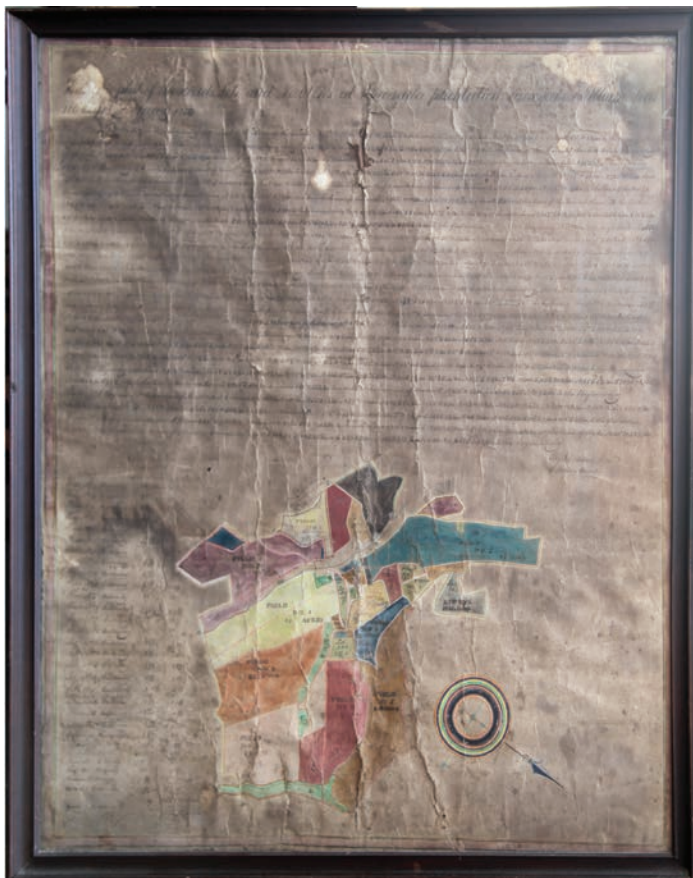
The inscription on this family document reads: "This is a plat of the Fields, Lots and Meadows at Pharsalia plantation surveyed for William Massie Esqr. February 1850"