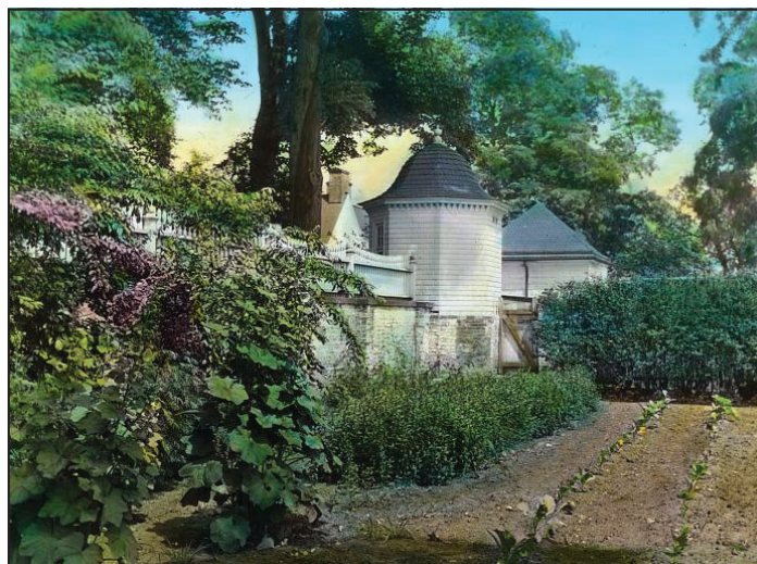
“Mount Vernon,” George Washington house, George Washington Parkway, Mt. Vernon, Virginia. Privy in lower garden. 1894.