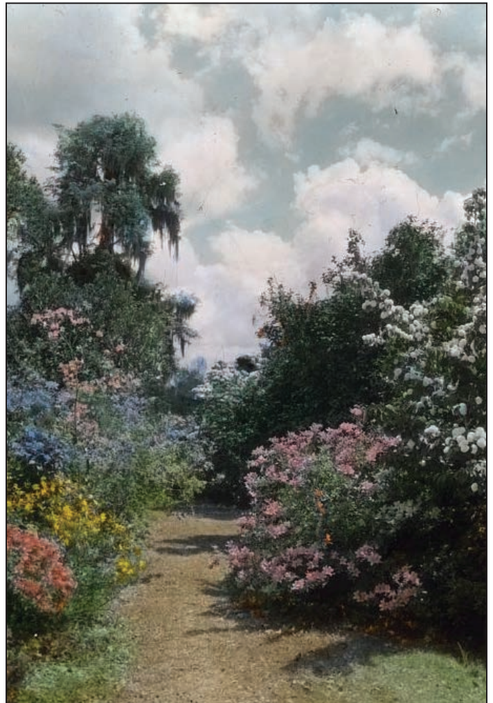
"Magnolia Plantation," azaleas along pathway, spring 1928. Charleston, South Carolina.