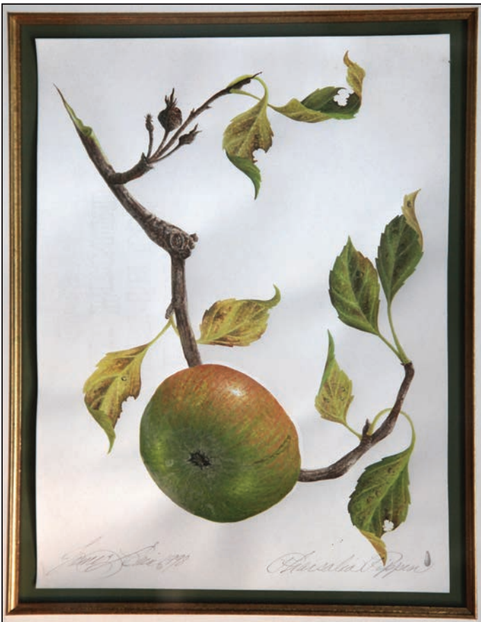
Pharsalia Apple.