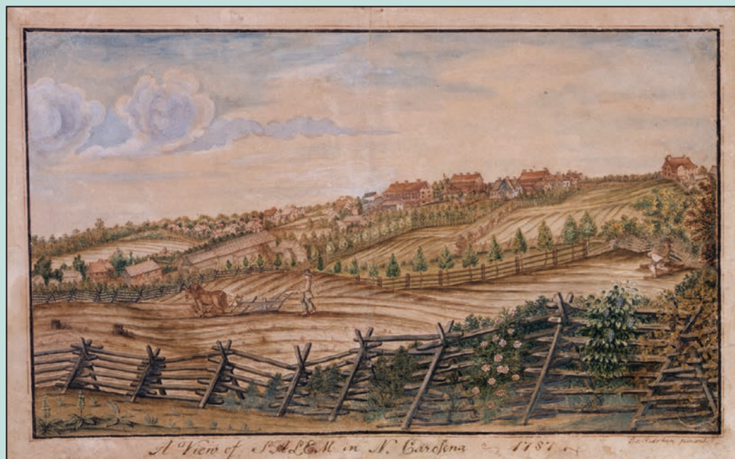
"A View of Salem in N. Carolina - 1787" Ludwig Gottfried von Redeken. Salem, North Carolina, 1787. Watercolor on paper.

For information: (336) 721-7361 / sgant@oldsalem.org