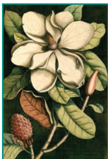
Magnolia grandiflora The Laurel Tree of Carolina Catesby's Natural History , 1743