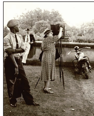
Frances Benjamin Johnston in 1896 (above) seated in her Washington, DC studio, and in the 1930s (below) photographing on site at the Biltmore Estate in Asheville, NC.