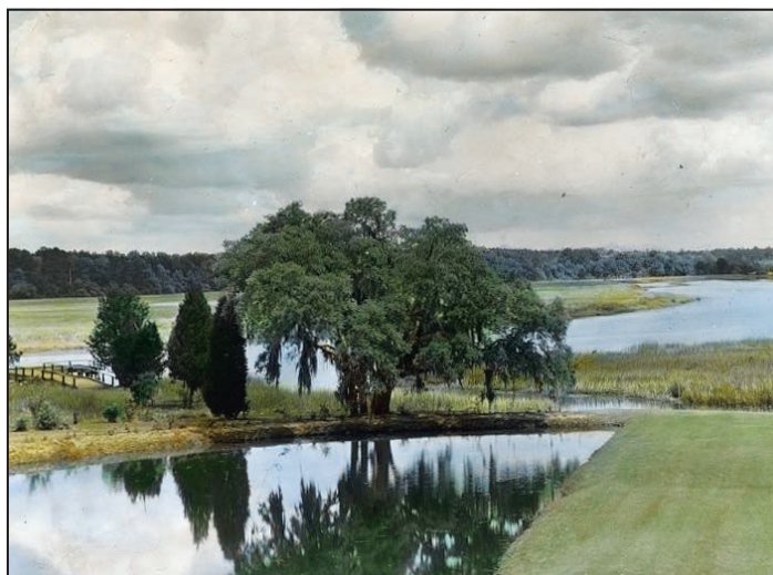
“Middleton Place,” with live oak and Butterfly Lake, spring 1928. Charleston, South Carolina.