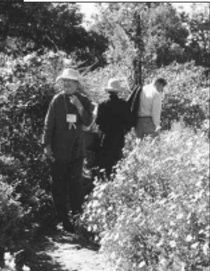
In Boone Hall's Garden.

The Chinas, teas, and polyanthas, he maintains, are the best roses for the Southern climate, and his slides of 'Old Blush' surviving in San Antonio, New Braunfels, Navasota, Independence, and Roundtop Texas confirmed his premise.