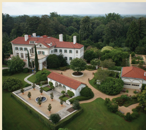
Hills and Dales Estate, La Grange, Georgia

The SGHS website ( www.southerngardenhistory.org ) contains posts on historic gardens, plants, and people, as well as a calendar with updates on the SGHS annual meeting and other activities. All issues of Magnolia are available with an extensive index to facilitate access. Southern Plant Lists (a compendium of primary source plant records) and links to SGHS member institutions and other garden and landscape programs are included, as well as SGHS membership and contact information.