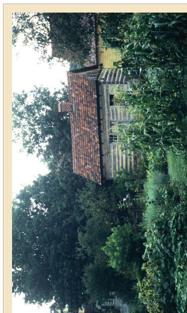
Miksch Garden, Old Salem, North Carolina