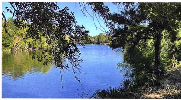
The Cane River