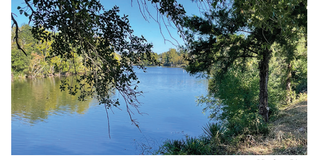
The Cane River