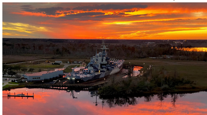
Battleship North Carolina

Cocktails and Dinner on the Battleship North Carolina