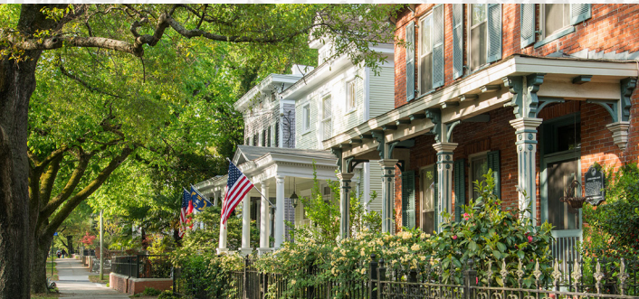
Burgwin-Wright House and Gardens

Wilmington, North Carolina April 12 - 14, 2024 Friday and Saturday With optional Sunday Picnic